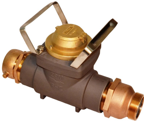
FHZ30S**-CV Configured with NC2530B-CV Check Valve Assembly