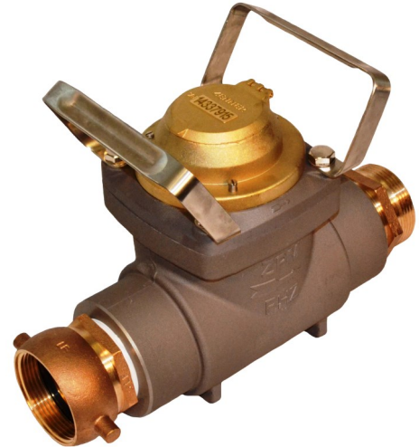
FHZ25S** Stainless Steel Double Strap Handle

OPTIONS: Gate Valves, check valves, reduced pressure backflow preventers, locking devices, special order connections, stainless steel double handles, pistol grip handles, "add-on" restrictor plates and stands.