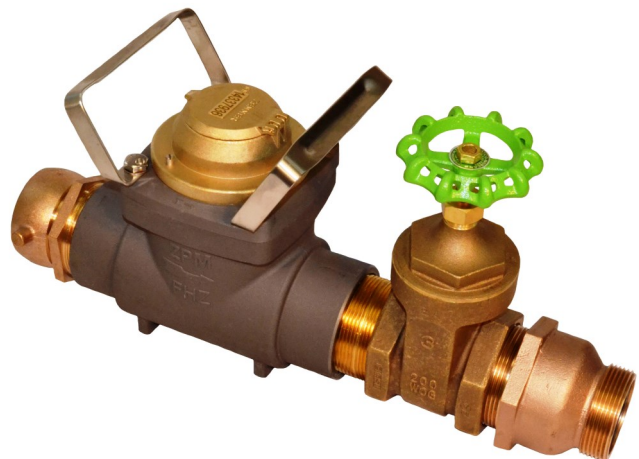
FHZ30S**-GVCV Configured with 3" Gate Valve and NC2530B-CV Check Valve Assembly