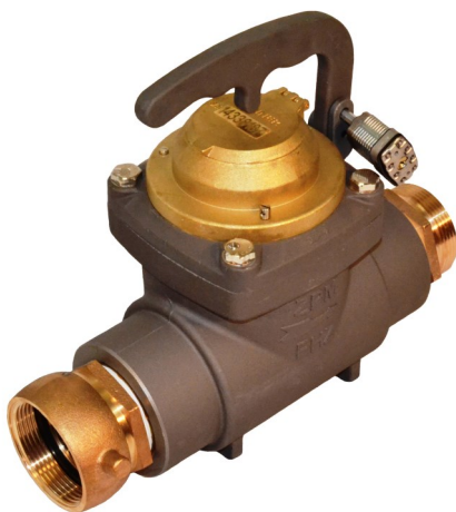
FHZ25P** Padlock Single Handle