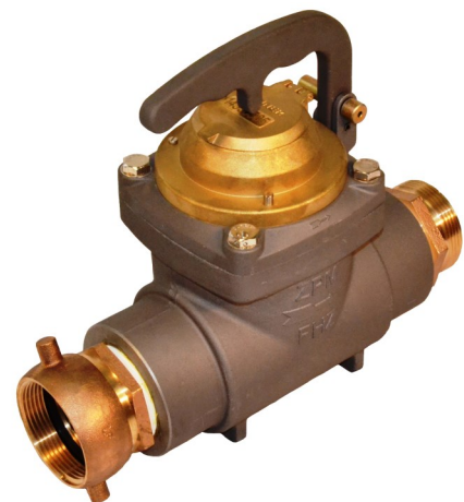
FHZ25B** Barrel Lock Single Handle