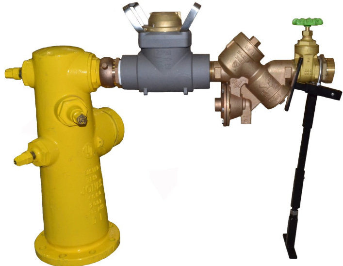
FHZ20S**-W975 Configured with Dual Check RPZ Backflow Preventer and Stand