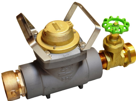
FHZ20S**-GV Configured with 2" Gate Valve